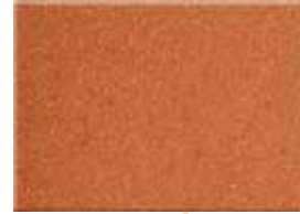
Agra Red Sandstone