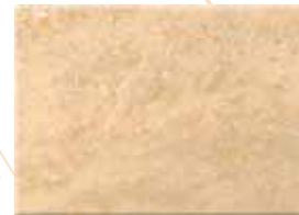
Roman Classic Travertine