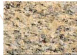
New Venetian Gold