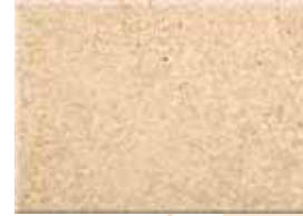
Indiana Bluff Limestone